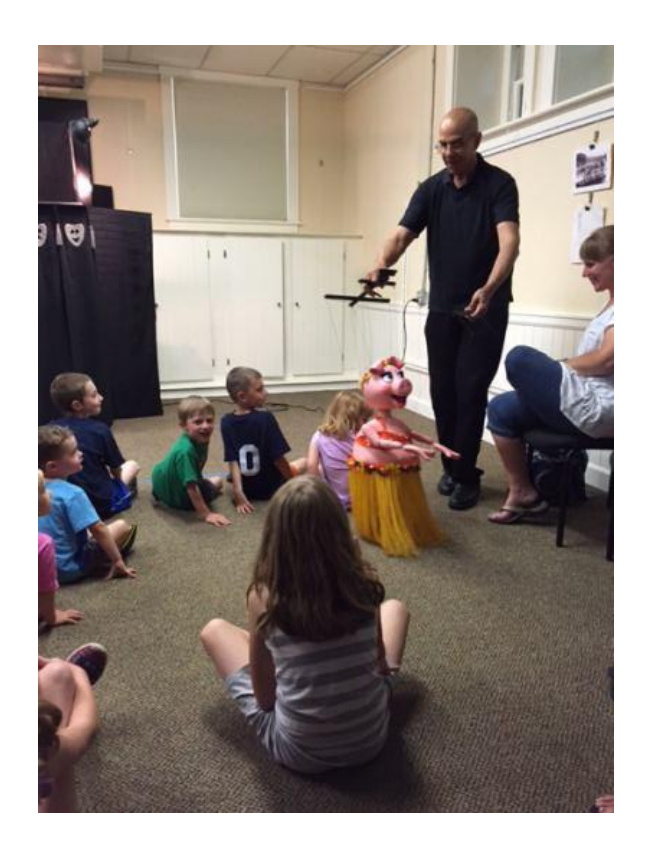
On June 29th 2015 the Pumpernickel Puppets presented "Sir George the Dragon." After the show the audience had a chance to see how a puppet show is created and presented.