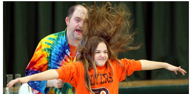
SCIENCE & STORY: Enjoy the fantasy and the science of The Science Tellers