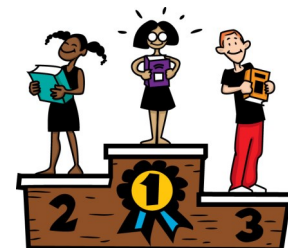
Get set for action and excitement with