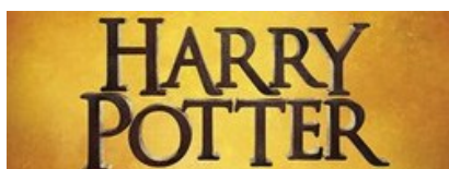
Enjoy the Harry Potter Experience