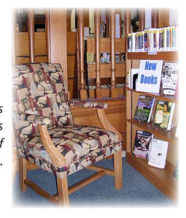
New books display allows for ease of browsing.