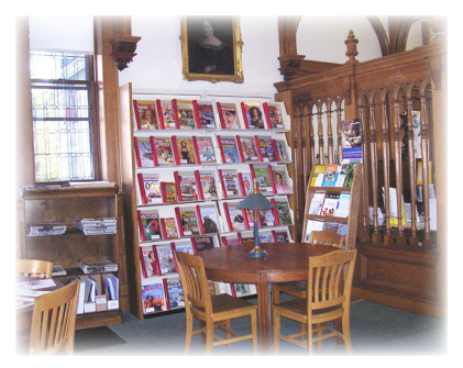
The Reading Room