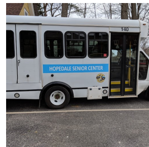
Mike our Van Driver

COVID-19 restrictions : The number of van passengers per run will not exceed 4 people. Riders will continue to be required to wear masks.