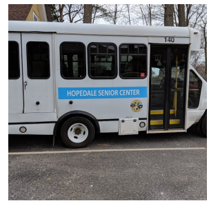
Mike our Van Driver

COVID-19 restrictions : The number of van passengers per run will not exceed 4 people. Riders will continue to be required to wear masks.