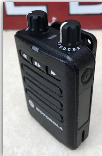
(Pictured above) Minotaur VI Pager

Call Firefighters occasionally are called upon to staff the fire station by working a "shift" when they are unable to be filled by Career Firefighters and/or during times of severe weather as determined by the Fire Chief and/or his designee.